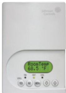
Rooftop Control Unit Controls Rooftop and Provides Supervisory Functions

This illustration of a retrofit or new three-zone system includes a rooftop controller, three zoning controls and an optional supervisory controller.