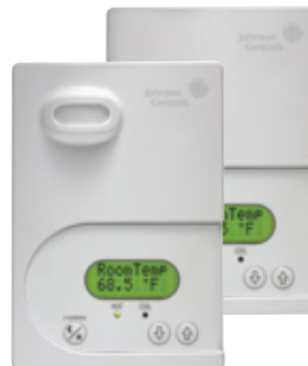
Zone Controllers Provide Local Digital User Interface